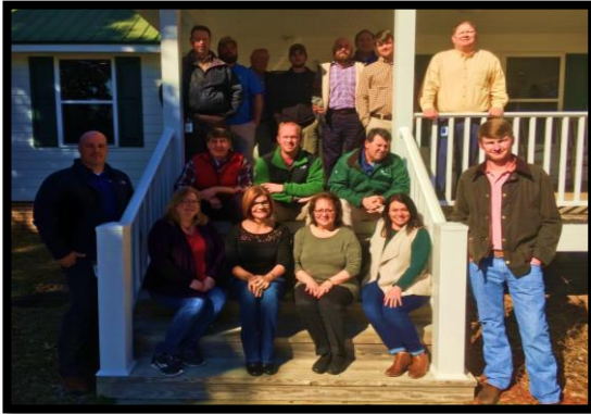
Participants from Kentucky, West Virginia, Vermont, Las Vegas, South Carolina, and North Carolina

Class C-100 at Moncks Corner, SC January 22-25, 2018