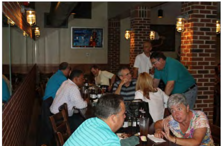
I'm telling you Paul, you don't want to go there!~ Cereally.