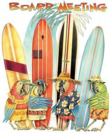
Didn't happen there. All the pics are serious. Seriously?