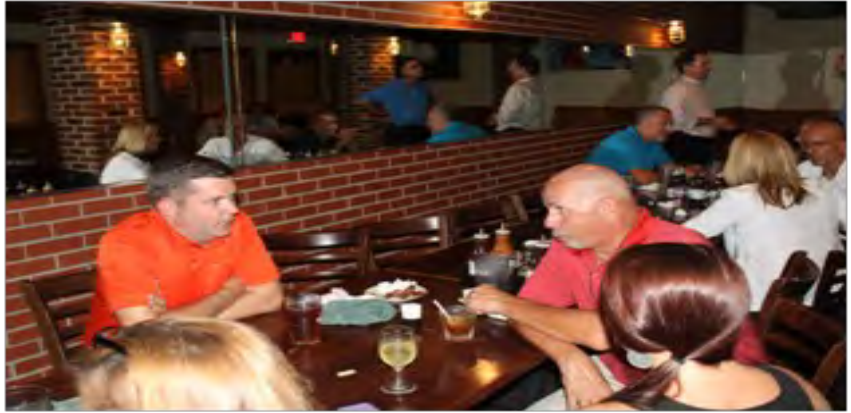
The cold, damp weather...isn't it summer time there? Serious topic.