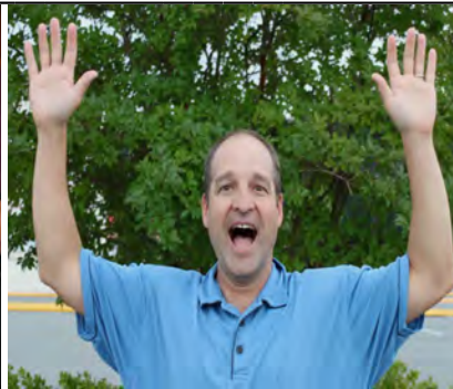
Yeagleymeister. Still scary, huh?