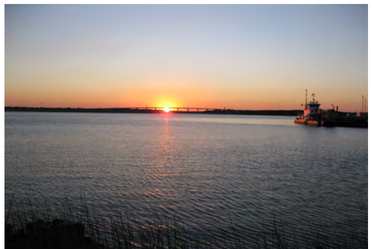
The Ashley River at sunset.